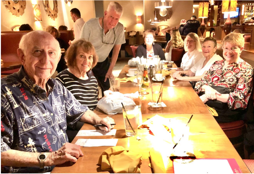
(left) Boca Christians Eating Out at a recent Thursday dinner.