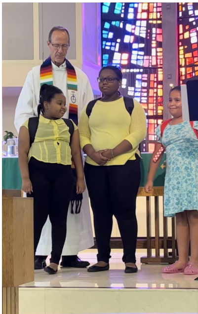
Blessing the backpacks.