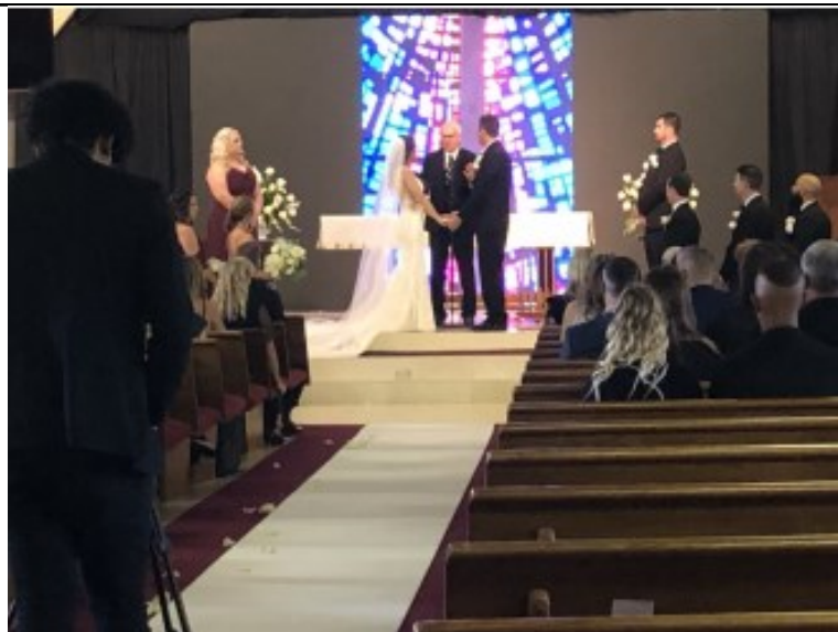
COTH hosted a beautiful wedding in mid-October

Those who assist in monthly mailings of this Vantage newsletter and seasonal mailings: